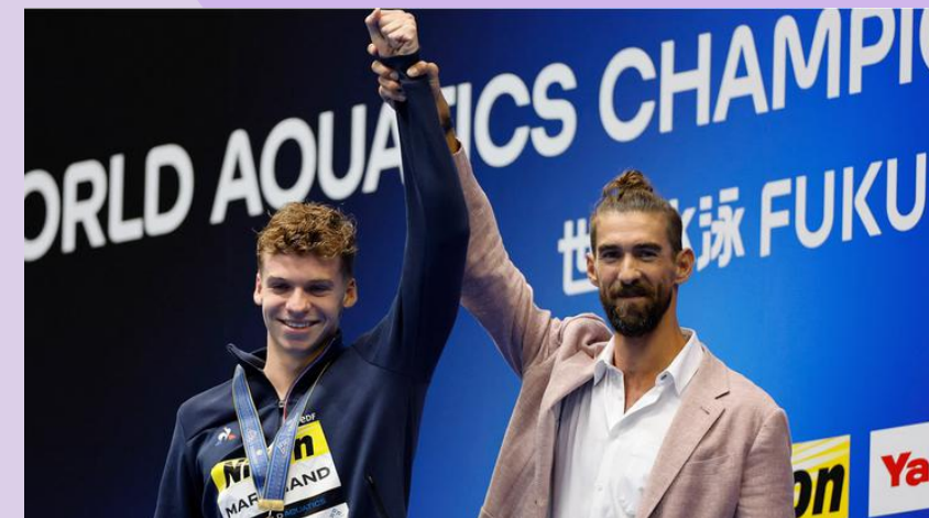
LEON MARCHAND (FRA) BROKE MICHAEL PHELPS' LAST STANDING RECORD IN THE 400 IM