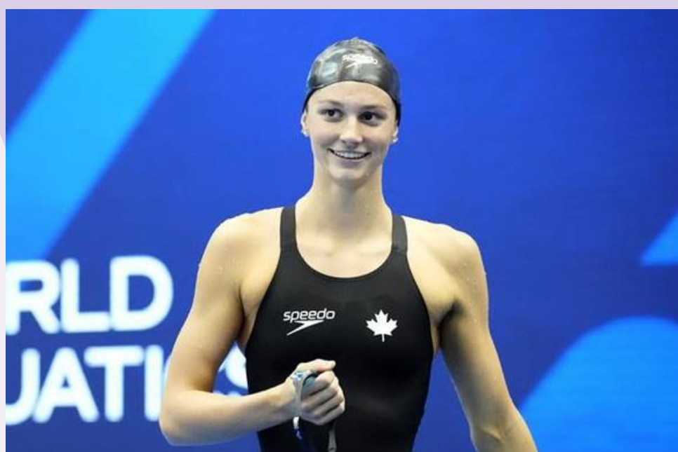
SUMMER MCINTOSH (CAN)