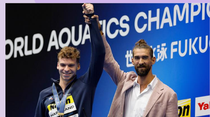
LEON MARCHAND (FRA) BROKE MICHAEL PHELPS' LAST STANDING RECORD IN THE 400 IM