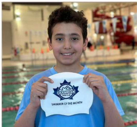
TCRC Olympic Way Fares Zidan