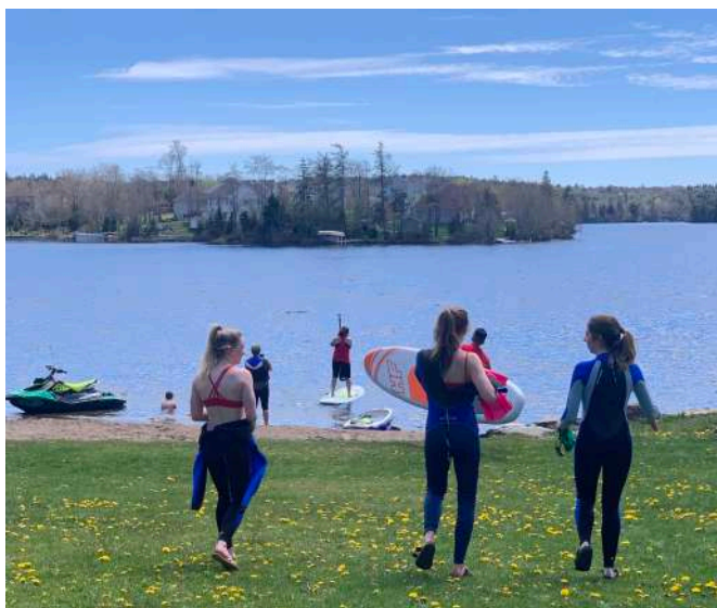
SWIMMERS ELLA D, LUCY J & MEG B BRAVING THE LAKE IN MAY!

Team Pride - Integrity - Dedication - Leadership