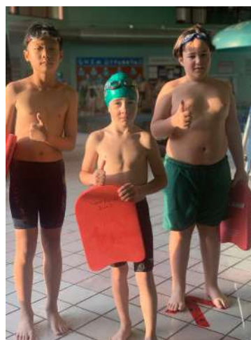
Race Day for Mini-Waves!!

TEAM PRIDE - INTEGRITY - DEDICATION - LEADERSHIP