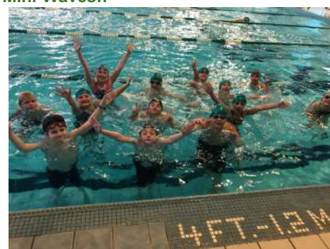
Big Smiles at the Pool

"SUCCESS MEANS HAVING ENGAGED IN THE PROCESS CORRECTLY. UNDERSTANDING HOW THE RHYTHM OF LIFE WORKS, AND NOT TAKING SHORTCUTS" -AARON PIERSOL, 7X OLYMPIC GOLD MEDALIST