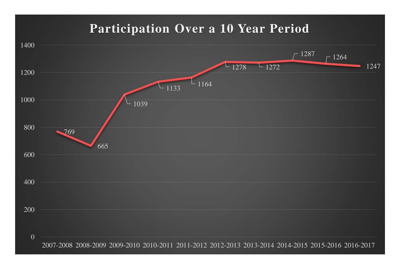
Figure 1. Swim NB registered participants over the last 10 years.

Swim New Brunswick (Swim NB) is a non-profit provincial sport organization that is governing body for swimming in New Brunswick (NB) for the promotion, guidance and regulation of competitive swimmers and their programs. It is directed by a volunteer board representing every club in the province. Its policies are administered by a full time Executive Director, assisted by numerous volunteer Committee Chairs and the SNB Board. Its membership is comprised of swimmers in Age-group, University and Master's programs; coaches; officials; administrators. Recently, Swim NB has a witnessed a slight decline in registration from 2014-2015 swim season (see Figure 1). Furthermore, Figure 2 provides the male versus female participation rates for the last 10 years.