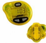
Finis Tempo Trainer Pro

This specialized piece of equipment is only for senior swimmers, please check with your coach. Swimmers in other groups should not purchase this equipment until they reach those levels.