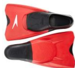
Speedo Short Blade Training Fins