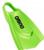
Arena Powerfin Pro 2