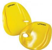
Finis Agility Paddles