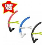
Michael Phelps Focus Snk